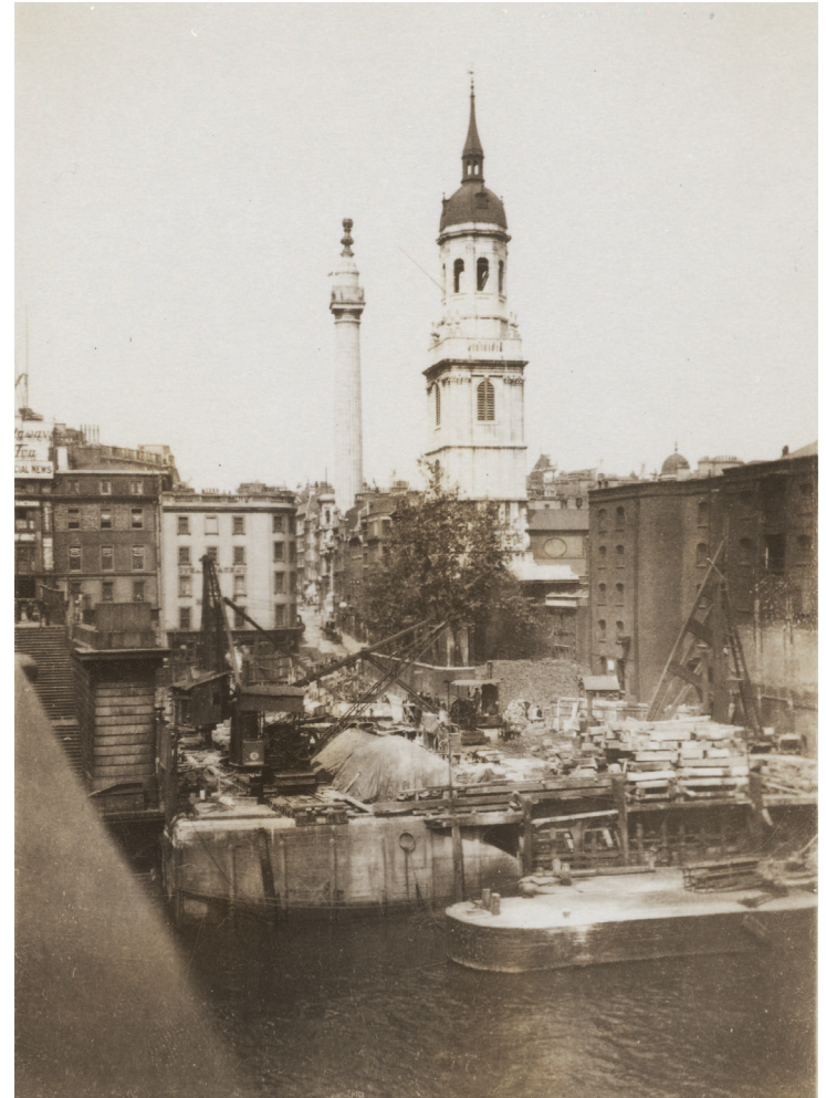
St Magnus Martyr and the monument, Billingsgate, from London Bridge, circa 1900

So it is probably a bit of a jolt to most readers when the scale abruptly changes again to the more literary and spooky dimensions of “A woman drew her long black hair out tight / And fiddled whisper music on those strings”. Eliot’s old friend Conrad Aiken remembered reading The Waste Land when it first came out and recognising this section (and some others he doesn’t specify) as having been