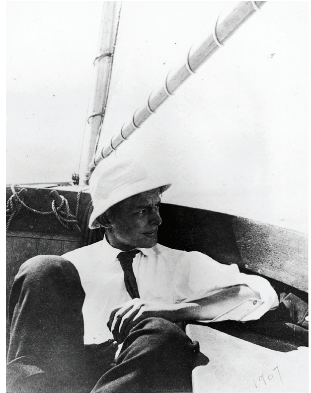
Eliot as a young man sailing (1907)

Fortunately we do not need to choose between reading the poem either as the articulation of the consciousness of an age or as the expression of a wholly personal crisis. When Eliot said a few years afterwards that the "great poet, in writing himself,