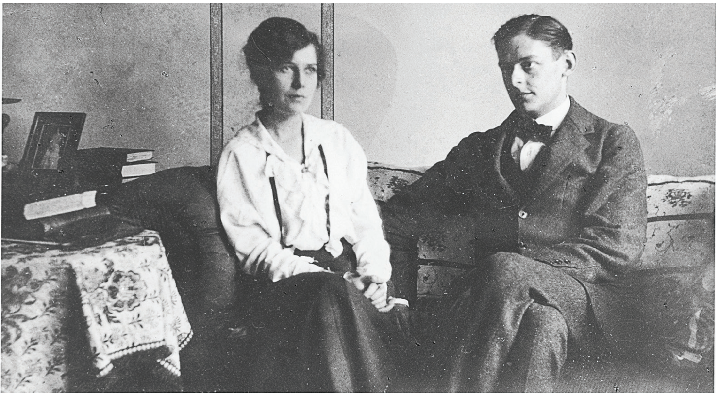
T.S. Eliot and Vivien, circa 1920