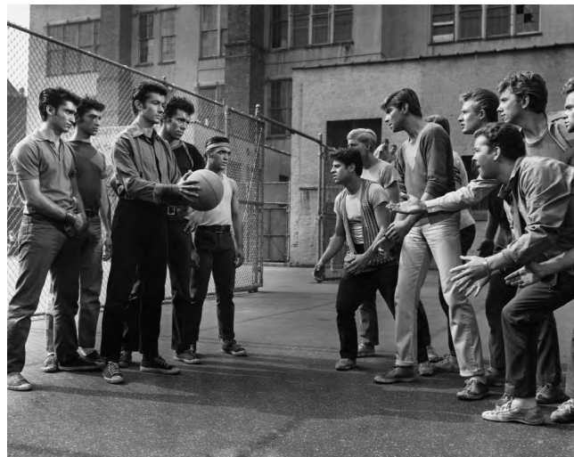
A scene from the 1961 film West Side Story. Leonard Bernstein's musical, set in 1950s' New York, was inspired by Romeo and Juliet (see page 66)

The new world that she has entered is far too vivid and particular for such (approximate) denotations: “it lightens” is a tired generalisation, far removed from life-giving passion. Again we can see how Juliet’s true language never simply describes things. Description assumes that the thing described is separate from the language being used, or from the passion that attends its experiencing. Description escapes experience; it puts it to rest, leaves it behind, accommodates itself without struggle to evolving eventualities: it lightens. Such phrases flatten and generalize experience, allowing for livable continuity. Merely to be able to say “it lightens” is the impossible antithesis of Juliet’s situation. There would be relief in such words; they would signify survival, a light ahead, a light-ening of terror. But this is not Juliet’s experience. Lightning, for her, is not alleviation. It is the sudden irrevocability of that thing, lightning, which she and her lover have become – and it is the stunned, silent darkness that succeeds it.