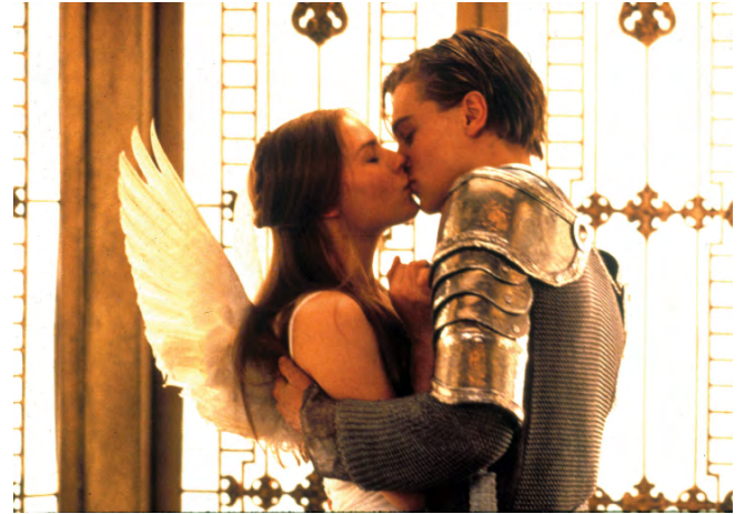
Claire Danes and Leonardo DiCaprio in Baz Luhrmann's 1996 Romeo+Juliet

But there is more than one story going on here, and the public narrative drive is not necessarily the one we most cherish. Capulet has already given us an image of Juliet that – like our glimpse of Romeo in the wood – is powerfully separate from the mundane, male-directed imperatives all around. In this image, Juliet is delicate, vulnerable, unfinished: “my Child is yet a stranger in the world”. She is like someone from a Coleridge or Wordsworth ballad, the Child or Stranger, bringing knowledge from elsewhere but unfit for here and now. The sense is that she has been initiated into mysteries; she is of some other substance or material to other mortals; she is constitutionally homeless. Where is she from, we might ask, this