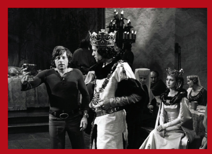
Roman Polanski and Jon Finch on the set of the 1971 film