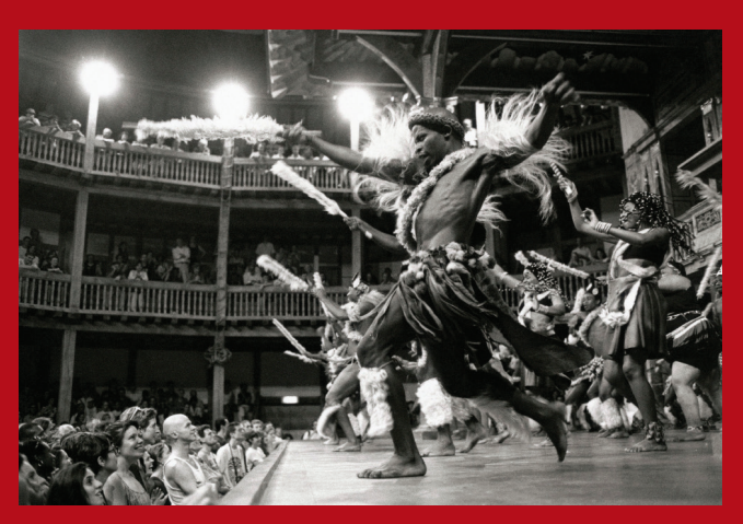
uMabatha, the South African playwright Welcome Msomi's adaptation of Macbeth, set in an early 19th-century Zulu tribe, The Globe, 2003

The most frequently occurring words in the play are "blood" and "night", each of which occurs – in various forms – more than 40 times.