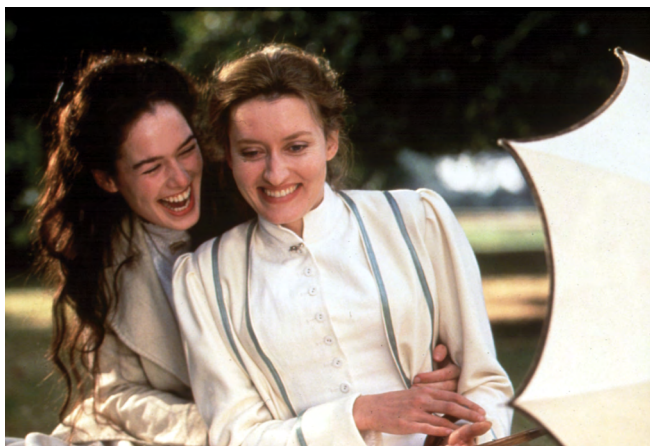
Natascha McElhone as the young Clarissa and Lena Headey as Sally Seton in Marleen Gorris's 1997 film Mrs Dalloway

describe Clarissa's feelings at these times, when she feels for women "what men felt" for women, is practically orgasmic: