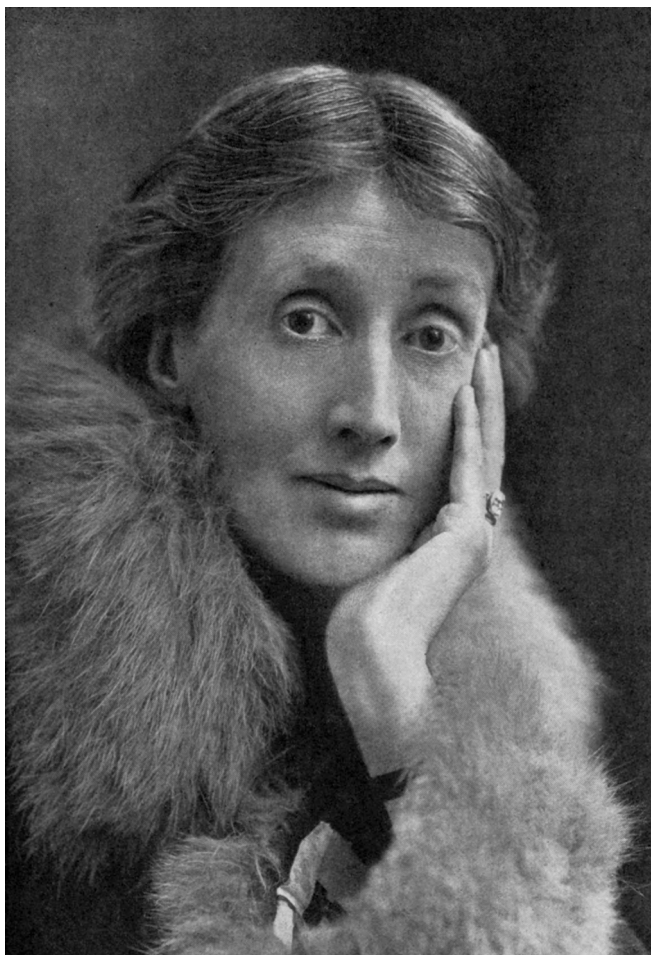
Virginia Woolf, circa 1930