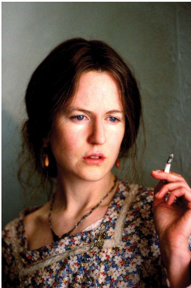
Nicole Kidman as Virginia Woolf in Stephen Daldry's 2002 film, The Hours