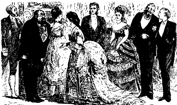
Mrs Dalloway's party, a lithograph

This vagueness is like a “kind of counter rhetoric” to what Cunningham calls the novel’s “wonderful radical thinginess”, the stress on hats, dresses, kitchen utensils, etc. The writing keeps aggressively “pointing at what it and its people want us to see and know... There, it keeps saying, there she was, there he was, there were the roses.” This rhetorical device is called deixis – the use of demonstratives, adverbs of place, pronouns and